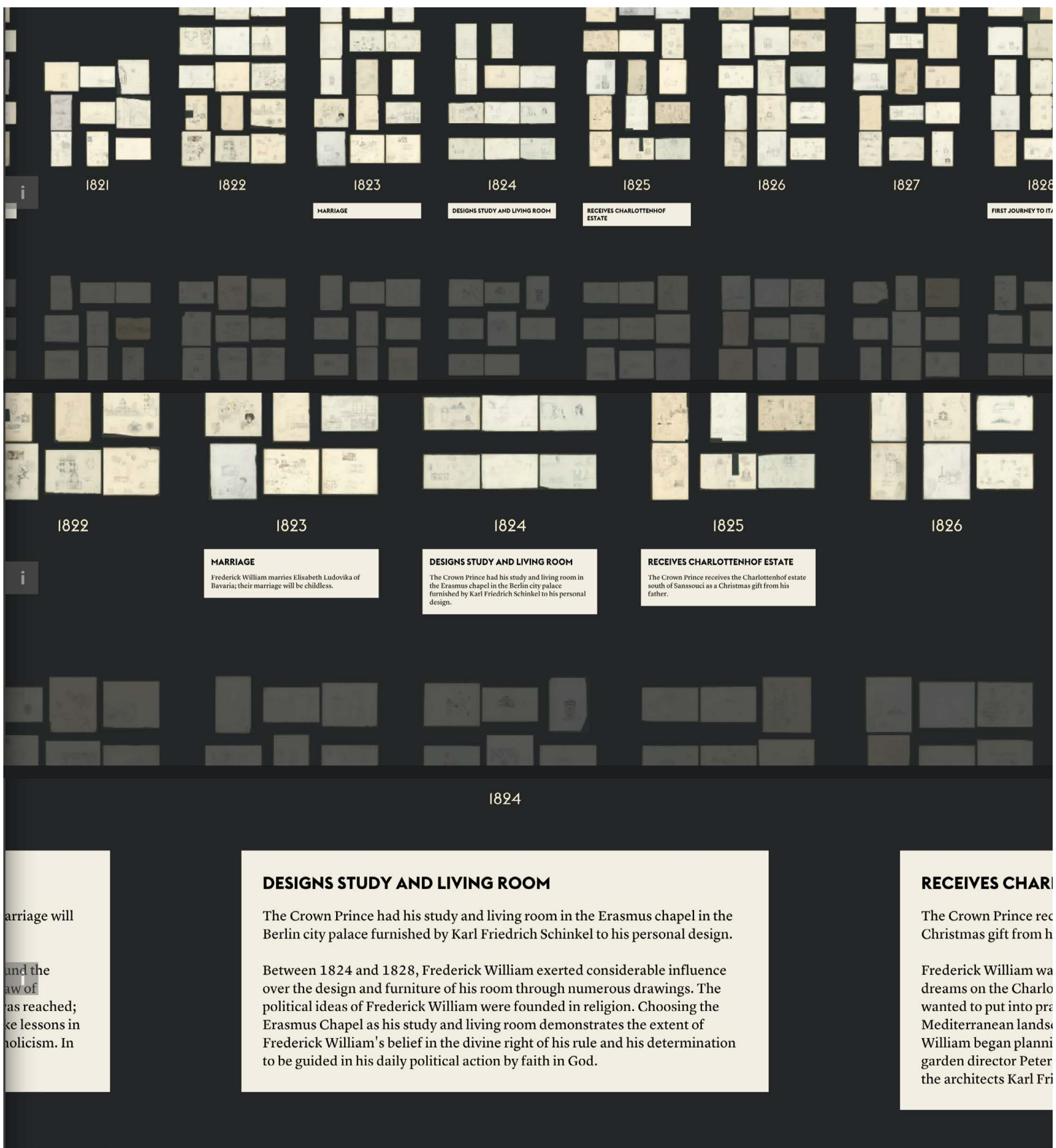
Figure 3: The timeline provides historical context at varying levels of detail.