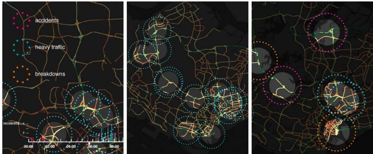
Figure 1: Traffic incidents highlighted using the Traffic Origins approach. When an incident occurs, its location is marked by an expanding circle that reveals traffic conditions in the immediate vicinity.

Carlo Ratti‡ Senseable City Laboratory Massachusetts Institute of Technology