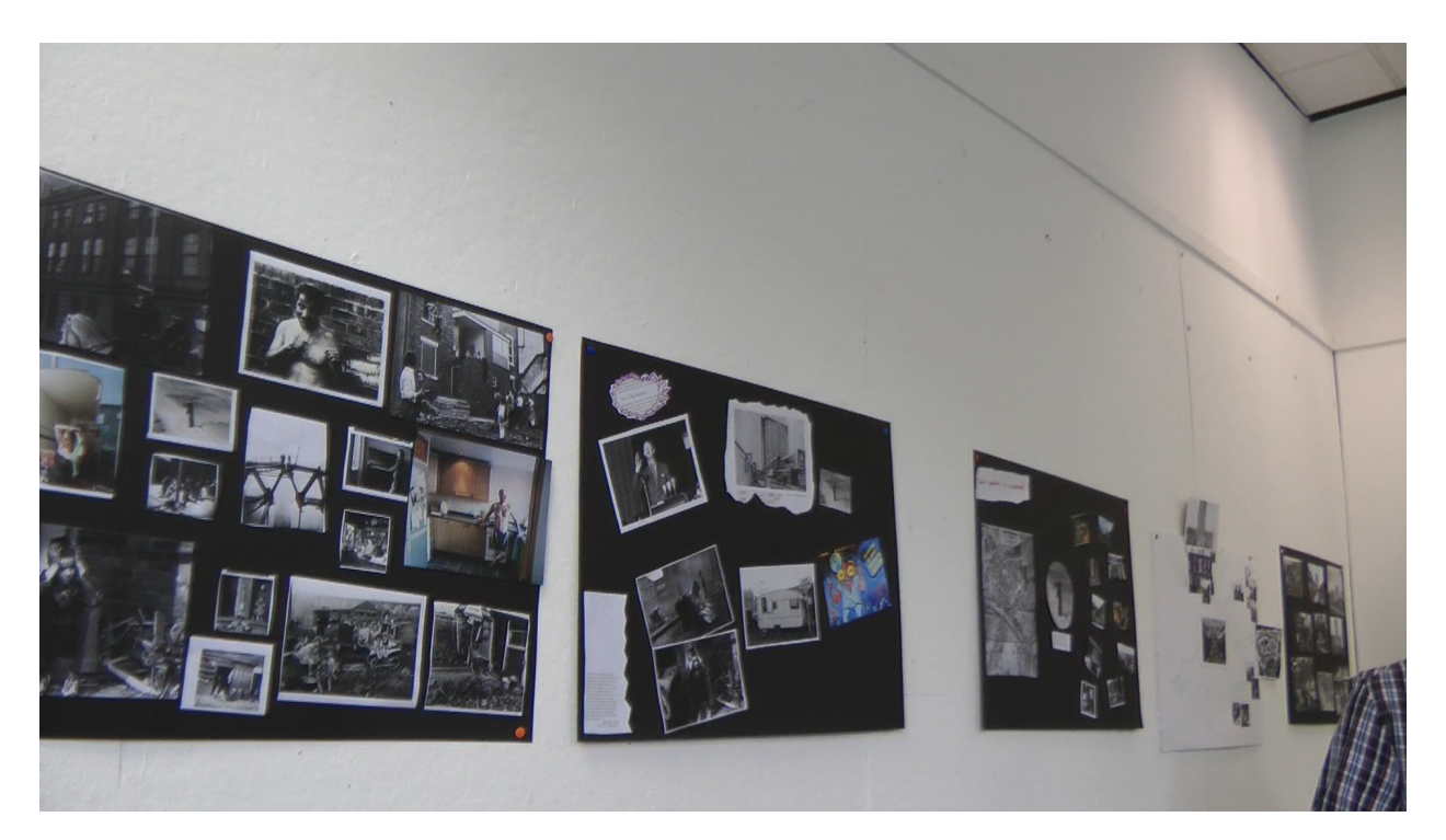
Figure 2: Collages were pinned up on the wall for the group interpretation.

Engaging participants in collaging and storytelling may serve to unlock hidden themes in a collection by creating new linkages. However, introducing new linkages also highlighted a tension between seeing an archive through new and old lenses. As interface designer we are posed with the question: 'how much creative license should a viewer have when exploring and juxtaposing content online?' The group interpretation not only allowed archivist and designers to confront the limits of an archive interface, but also supported us to gauge the extents a user may manipulate visual content of an archive.